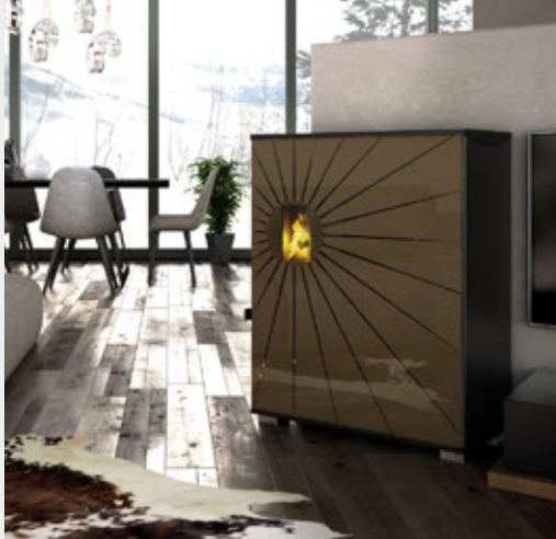
Cosmo 5.5 G 5,24 Kw / N 4,62 Kw 60x26x81 cm