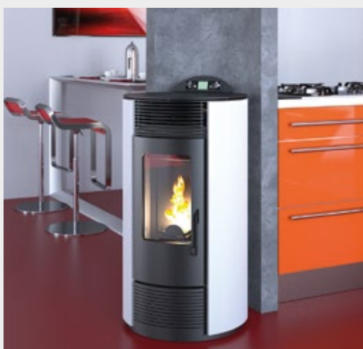
Minifocus 9 G 8,82 Kw / N 7,87 Kw 50x50x91 cm