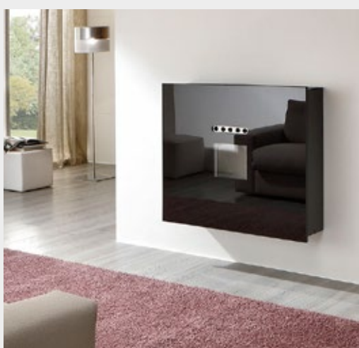
Quadra 11 Up G 11,11 Kw / N 9,83 Kw 95x26x95 cm