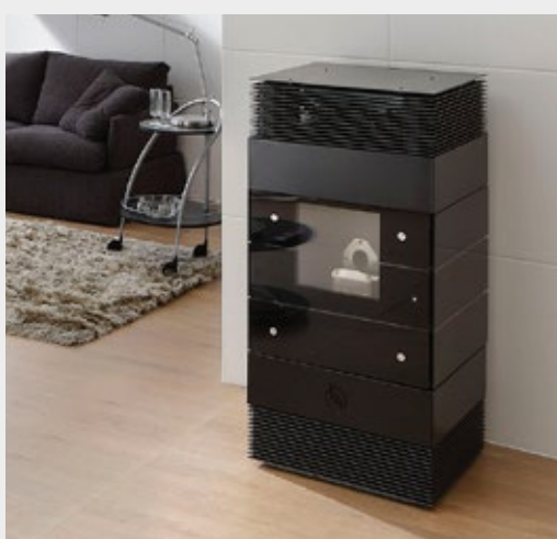
Wind 13 C - Wind 15 C2 G 15,22 Kw / N 13,53 Kw