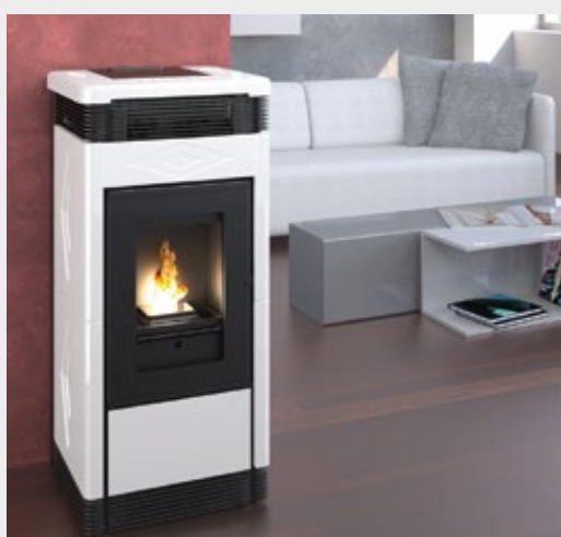
Twister 13 C - Twister 15 C2 G 15,22 Kw / N 13,53 Kw