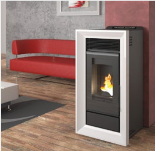
Cover 12 P G 11,48 Kw / N 10,40 Kw 52x54x101 cm