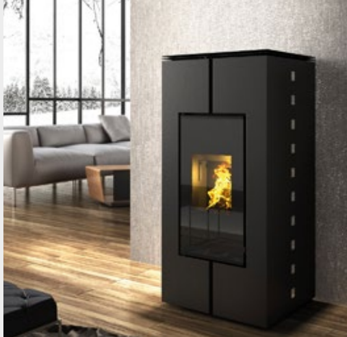
Relax 16 - G 15,95 Kw / N 14,74 Kw Relax 20 - G 19,27 Kw / N 17,80 Kw 51x51x112 cm