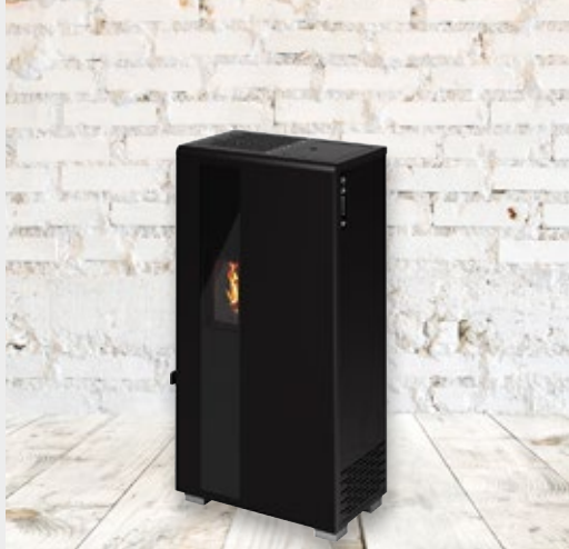
Icon Glass 5.5 G 5,24 Kw / N 4,62 Kw 45x27x88 cm

Hot-air pellet stoves Luftführende Pelletöfen Poêles à granulé à air Estufas de pellets de aire