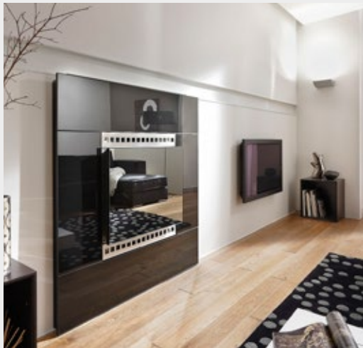
Glass 10 G 10,64 Kw / N 9,40 Kw 132x35x138 cm