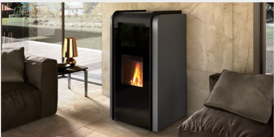
Calypso 24 - Calypso 32 G 28,55 Kw / N 26,02 Kw 62x67x120 cm