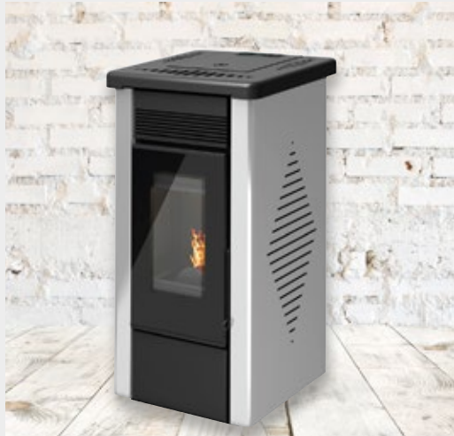
Giglio 12 - Mimosa 12 G 11,48 Kw / N 10,40 Kw 56x54x102 cm