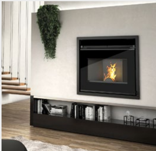
Inside 11 G 11,11 Kw / N 9,83 Kw 68x51x60 cm