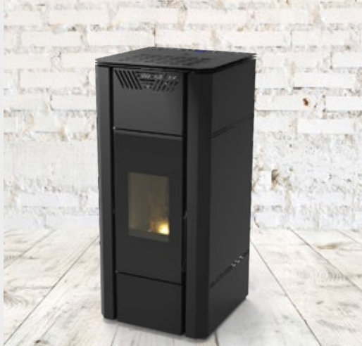
Emy 20 - Emy 32 G 19,27 Kw / N 17,80 Kw G 28,55 Kw / N 26,02 Kw 51x51x112 cm