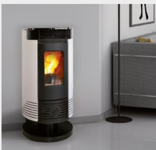
Scenic 12 G 11,48 Kw / N 10,40 Kw 50x110 cm