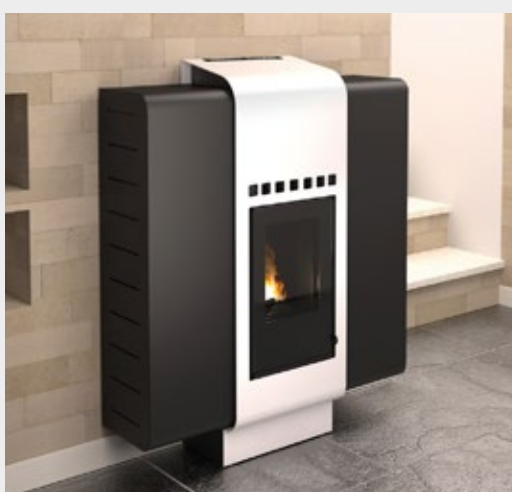
Flat 11 C G 11,11 Kw / N 9,83 Kw 91x26x110 cm