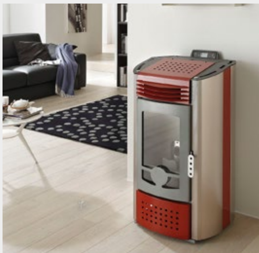
Smart 12 G 11,48 Kw / N 10,40 Kw 55x50x101 cm