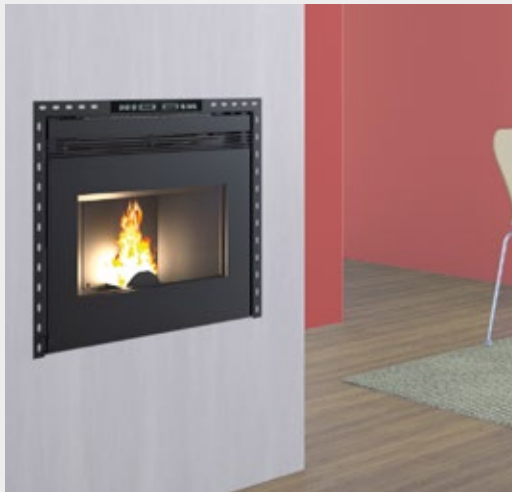
Easy 11 G 11,11 Kw / N 9,83 Kw 68x51x59 cm